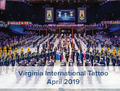
Virginia International Tattoo April 2019