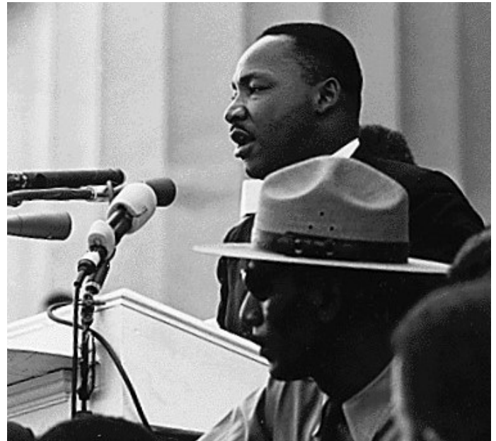
Dr. Martin Luther King Jr. speaking at the Civil Rights March on Washington, DC, in 1963

1969 *Arthur Mitchell founds Dance Theatre of Harlem.*