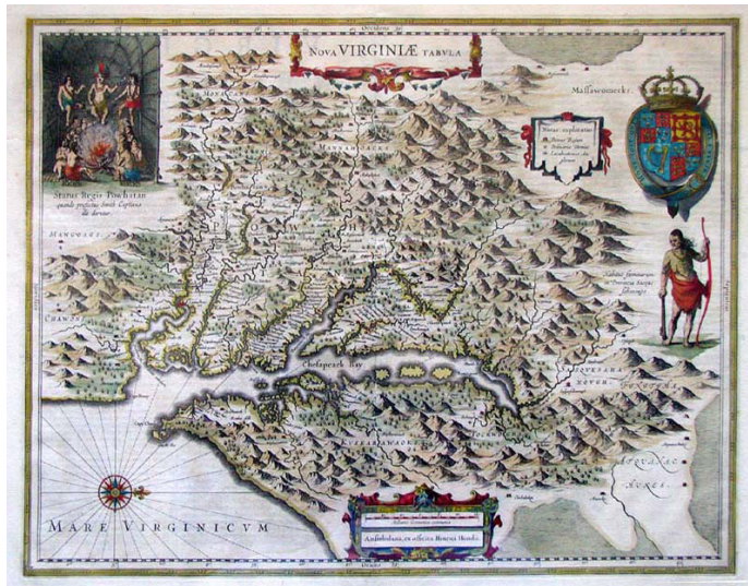
This map was based on John Smith's 1612 map of the Virginia Colony, and was colored in by Henricus Hondius in 1639.

This year marks the four-hundredth anniversary of important events in Virginia that shaped a new nation and continue to define it. To help recognize this anniversary, Dance Theatre of Harlem will be performing a brand new work. This world-premiere dance is inspired by the American history of four centuries ago.