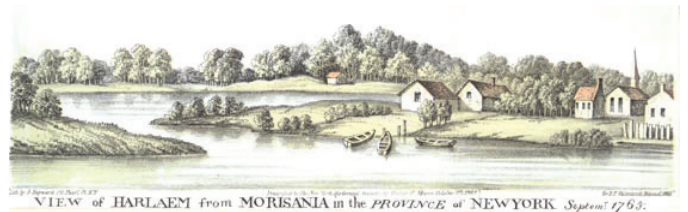
Harlem farmland, 1765