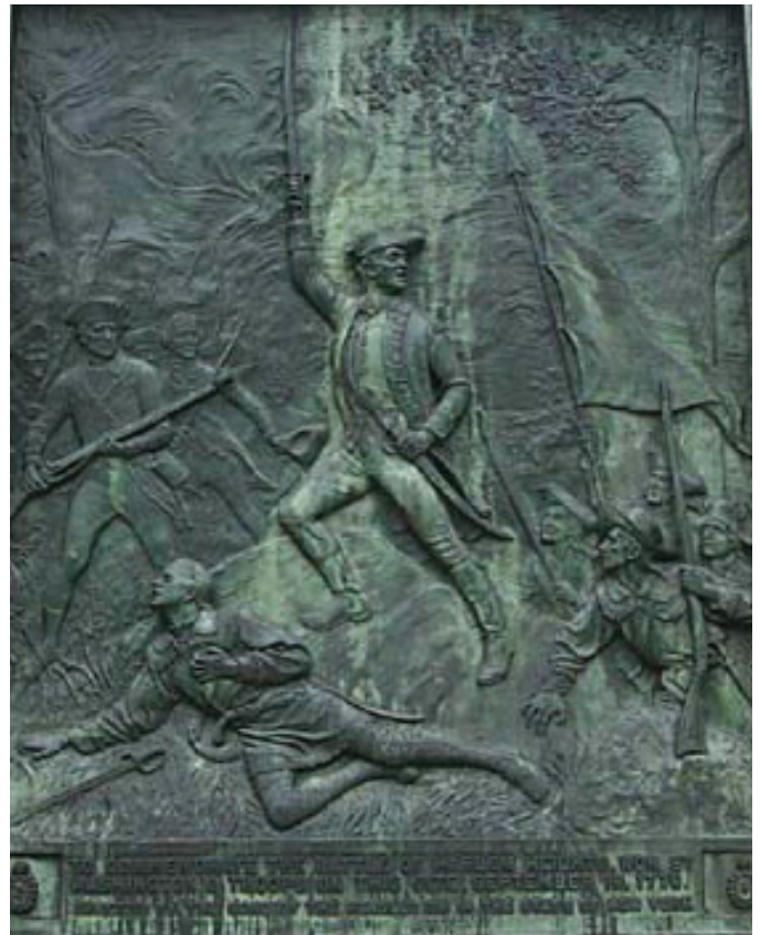
Battle of Harlem

Conditions in Harlem brightened in the late 1980s and early '90s when New York City made major upgrades to the area, installing new water mains and sewers, sidewalks, curbs, traffic lights, and streetlights, and planting trees. These and other improvements lured businesses, arts groups, and residents back to historic Harlem. Today Harlem is once again a vibrant, exciting, one-of-a-kind neighborhood.