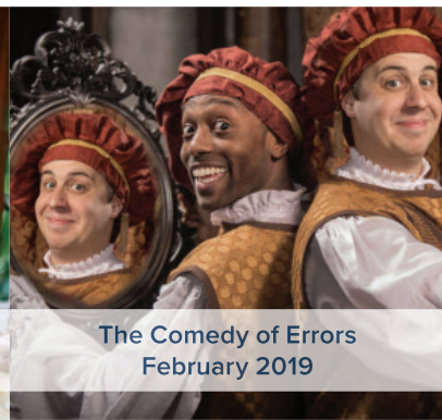
The Comedy of Errors February 2019