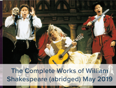
The Complete Works of William Shakespeare (abridged) May 2019