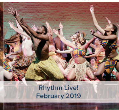
Rhythm Live! February 2019