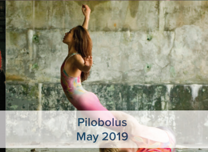
Pilobolus May 2019