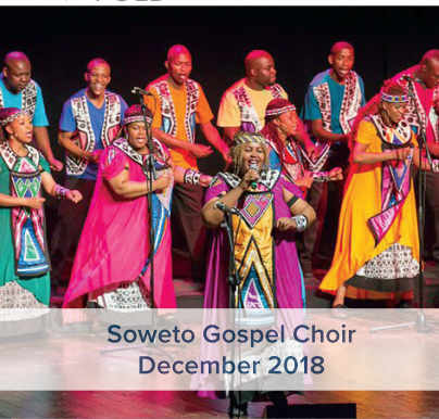
Soweto Gospel Choir December 2018