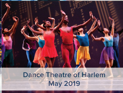
Dance Theatre of Harlem May 2019