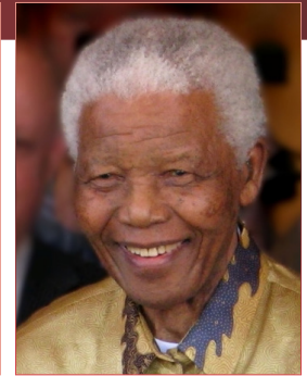
Archbishop Desmond Tutu. Nelson Mandela.

Since 1995 when the new democratic government came to power, much has been done to upgrade the infrastructure and beautify Soweto by creating parks and planting trees.