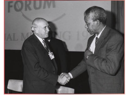
Frederik de Klerk and Nelson Mandela shake hands at the Annual Meeting of the World Economic Forum in January 1992.

and forcibly moved many people. It became illegal for people of different races to marry and for Black people to own land in white areas. The rights of Black people to vote or have political representation were also restricted.