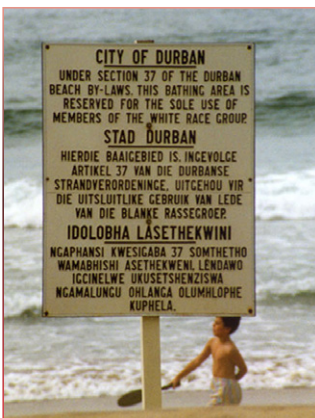
Durban Sign 1989 by Guinnog.

Consider the situations and events that led to both the Civil Rights Movement in the United States and the anti-apartheid movement in South Africa. What are the similarities? What are the differences? With these two human rights movements in mind, what might we predict about current movements against oppression in other parts of the world? Discuss these questions in small groups, write down your answers, and share with the class.