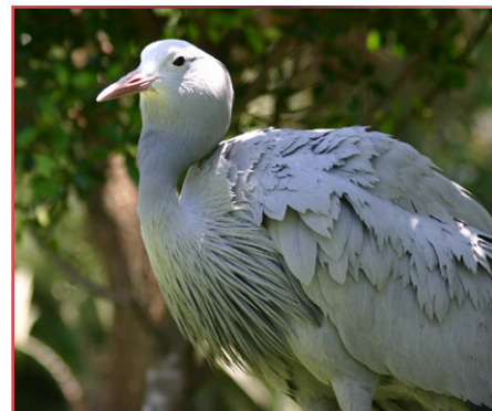
Photos L-R: Baboons, Camps Bay, Wild dog, Blue Crans