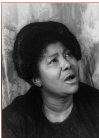
Mahalia Jackson, 1962, from the Carl Van Vechten photograph collection, Library of Congress.

As African Americans established their own churches in the nineteenth century, their religious music continued to evolve into a rhythmic and highly emotional style that usually involved the entire congregation—singing, clapping, and moving with the music. In the twentieth century, instruments such as tambourines and electric guitars were added to the sound, and gospel music spread as African Americans moved from the rural South to cities across the nation.