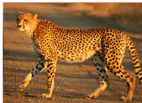
Photos L-R: Charles Bell by Jan van Riebeeck. Drakensberg, Cheetah