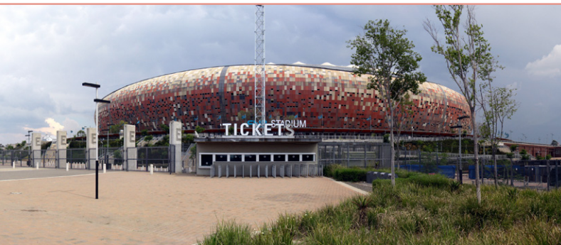
FNB Stadium by Prosthetic Head.

The name Soweto is an acronym for South Western Township , established in the early days of Johannesburg to house workers for the mining industry. Labor was drawn from many countries of Southern Africa, and this was the origin of the broad diversity of cultures in South Africa. During the time of apartheid, "townships" were established by whites. These were segregated public housing areas for nonwhites, usually built on the outskirts of cities.